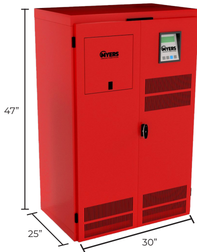
Models 1.5kVA to 5.0kVA