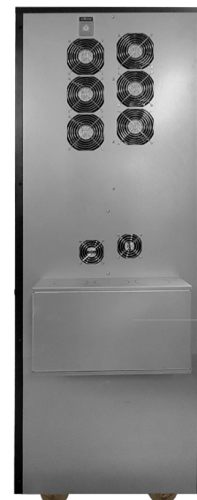
MEPSE91-40K rear view

Input, Output & Maintenance Bypass Breakers External Battery Terminal Blocks Main input & bypass input terminal blocks Internal battery modules