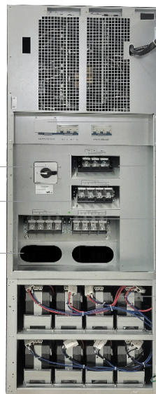
MEPSE91-40K front view (door & panels removed)

Internal Battery Switch Output Terminal Blocks Wire access from cabinet rear