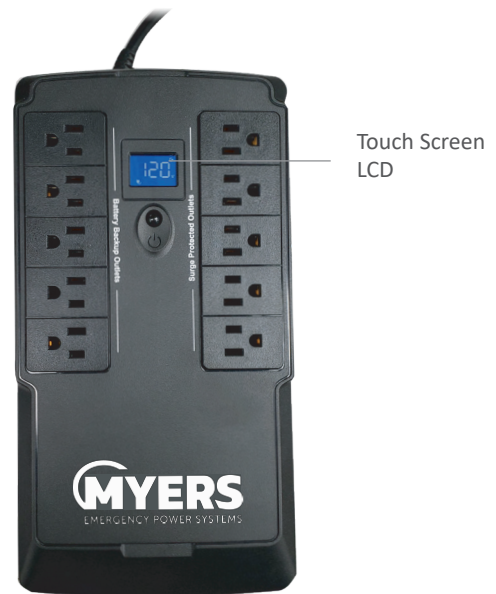
MEPS A60-850 top view