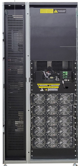
E90-5S 350kW UPS (door removed)

UPS Enclosure Includes slots for up to (5) 70kW power modules