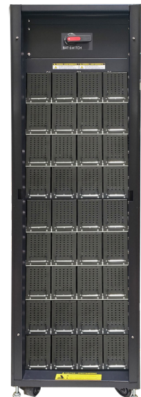
E90-BC (door removed)

UPS Enclosure Includes slots for up to (5) 70kW power modules