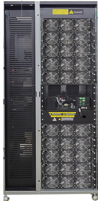
MEPS X90-10S 70kW - 700kW UPS (door removed)

UPS Enclosure Includes slots for up to (10) 70kW power modules