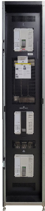
Maintenance Bypass (door removed)