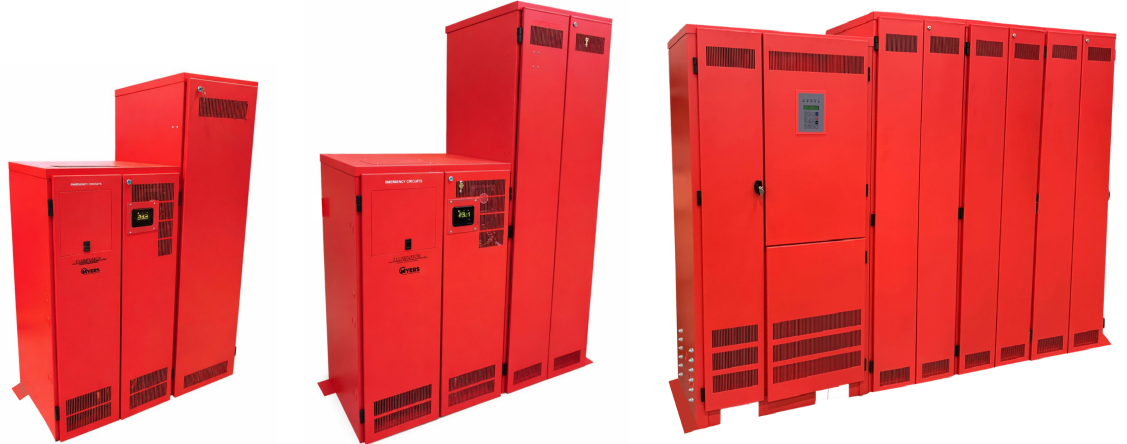
5kVA to 10kVA